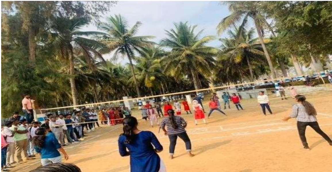
Glimpse of League matches between the departments on the field BCA, B'Com & BBA.

Inter Department Throwball Girls Championship League for the year 2020-21 coordinated and conducted by B. Com department students started on 16 Feb 2021 (Monday) at 0300pm in KGI campus Throwball Court. Director Academics, Vice- Principal KIMS, HODs of MBA, BBA, BCA, BCom, Teaching and Non-Teaching staff of KIMS was present for the inauguration of the tournament. Total 05 teams from UG department registered for the League championship. The students from BBA, BCom & BCA department of KIMS have participated in the championship. Each team had 7 players and 3 substitutes. Matches were played on points basis of 25 points per set, best of 3 set win the match, 5min break after each set. Match rules and regulations were briefed to all the players and the captains of the teams before the match. Referees were from the students' coordinators of B Com department. Total from the five teams each were played two matches against each other as leagues and the teams those who won at least two matches against their teams will qualify for the quarter finals. The